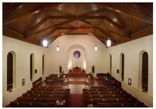
What people are saying.....